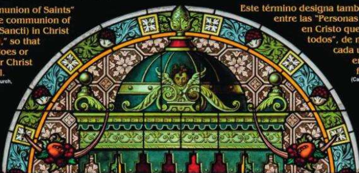
© Diocesan / St. Gertrude Church, Gamla Stan, Stockholm, Sweden