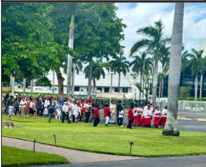
Procesion de la Fiesta del Corpus Christi.

Invitamos a todos los caballeros a unirse y formar parte como ujieres o servidores de esta, tu parroquia san Henry. Al finalizar esta Misa, estarán los ujieres tomando la información de quienes gusten anotarse y servir.