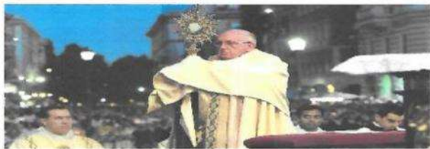
From St. Henry Catholic Parish we unite with Pope Francis as we profess our Faith in Jesus Christ present in the Blessed Sacrament. We will honor the Blessed Sacrament with a befitting procession, immediately following the 1:30 P.M. Mass on Sunday, June 2, Solemnity of Corpus Christi. Let us mobilize and get ready.