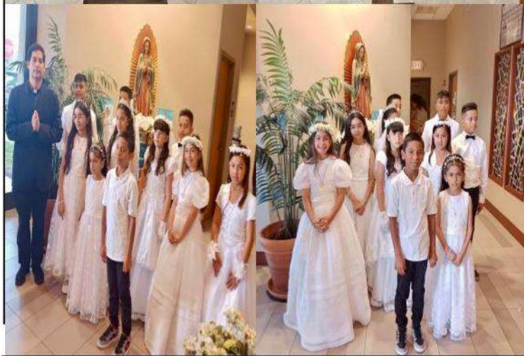
Top 2 pictures of English children that received their First Communion. La segunda fotografia es Espanol de los niños que recibieron la Primera Comunion.